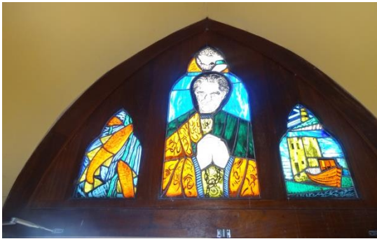
PAINTING SITUATED ABOVE THE CHURCH ENTRANCE DOOR OF REV D PETER O'NEILL P.P. BALLYMACODA LADYSBRIDGE AND SHANAGARRY

THIS IS THE FOUNDATION SLAB THAT HELD A WOODEN CROSS -WOOD CAME FROM THE OLD BALLYMACODA CHURCH WHEN THEY WERE BUILDING THE EXISTING CHURCH BACK IN 1796