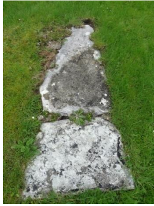
SITUATED TO THE LEFT ON THE GRASS AS YOU WALK TOWARD THE CHURCH DOOR

THIS IS THE FOUNDATION SLAB THAT HELD A WOODEN CROSS -WOOD CAME FROM THE OLD BALLYMACODA CHURCH WHEN THEY WERE BUILDING THE EXISTING CHURCH BACK IN 1796