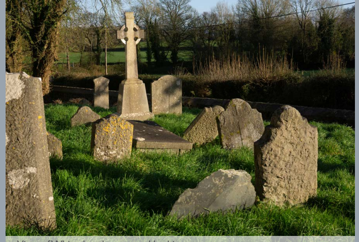
View of Whitechurch graveyard looking east