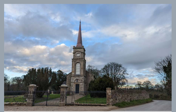
View of church and railings