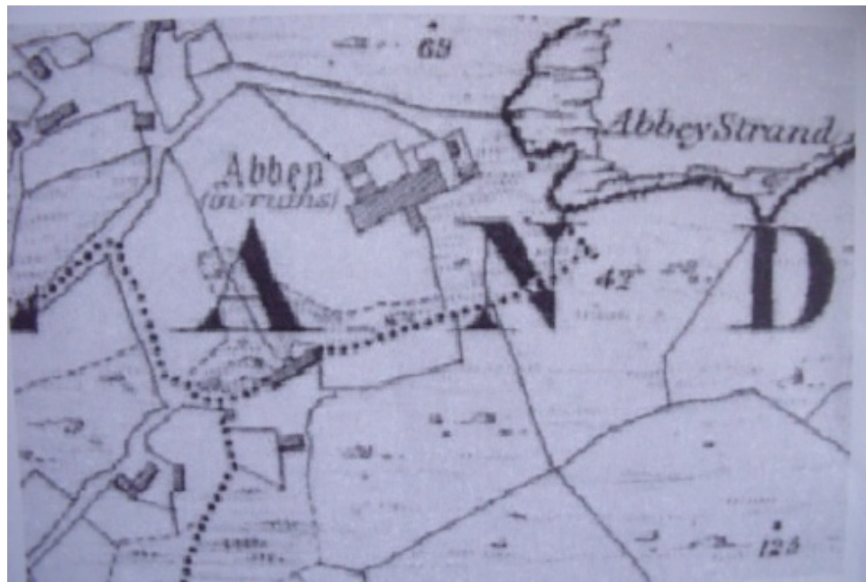
↑N Detail: Sherkin Friary. (Six-Inch Ordnance Survey Map. 1842).