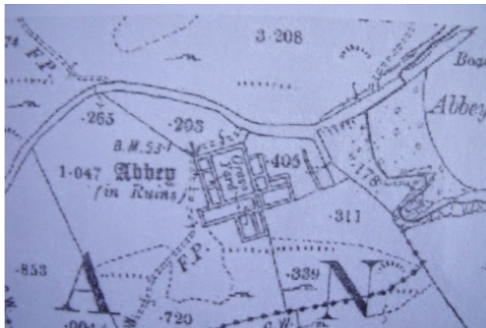
↑N Detail: Sherkin Friary. (25-Inch Ordnance Survey map. 1897-1913).