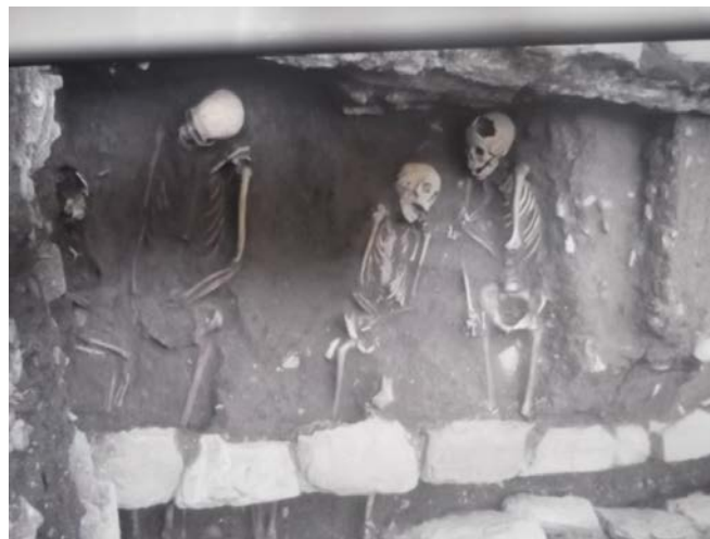
Remains of burials from the monastic period under cloister walk, uncovered during 1990 Office of Public Works excavation. (Photo: Courtesy of Dr. Anne Lynch, Department of Arts, Heritage and the Gaeltacht, Dublin).